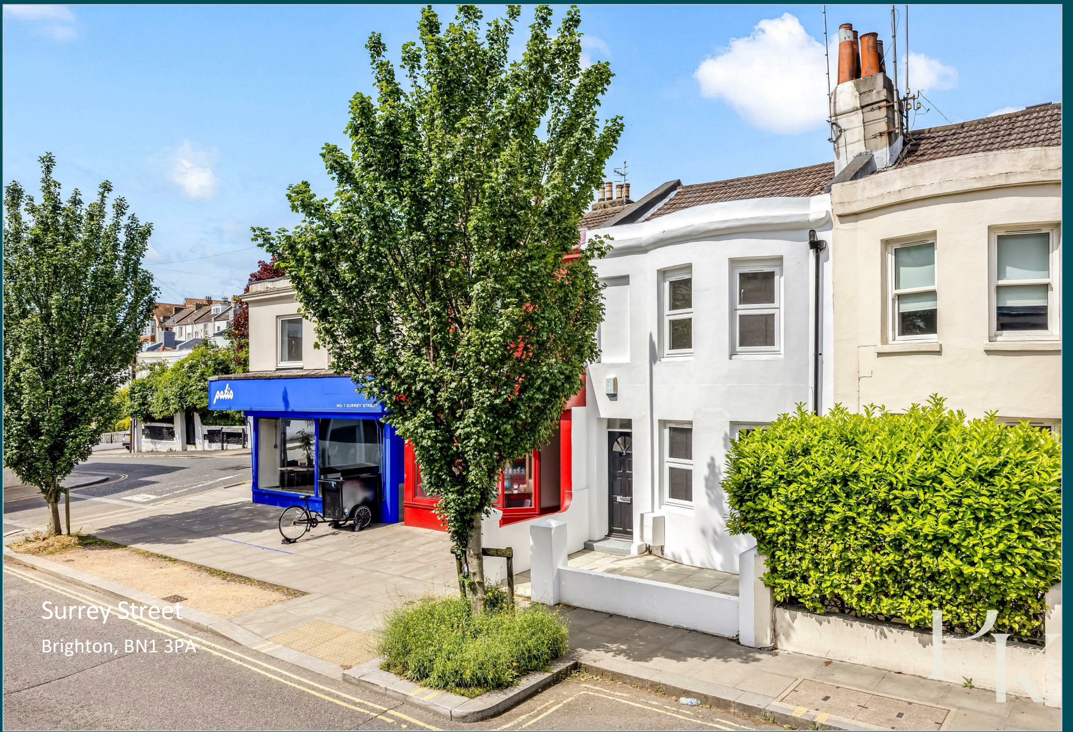
Surrey Street Brighton, BN1 3PA